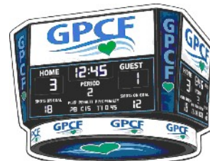
One idea showing GPCF proudly on the arena scoreboard