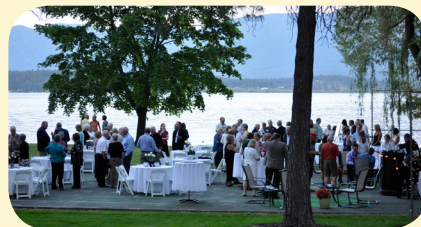
Last year friends and donors of the Greater Polson Community Foundation enjoyed an evening of "Diamonds en l'Air" at beautiful Bird Point surrounded by sparkling water, music, conversation, and laughter.